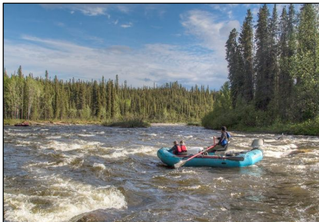
Photo of Gulkana River

The orders eliminating the rivers board (number 134) and the Wood-Tikchik board (number 126) and be found here: http://tinyurl.com/dawvmzaa